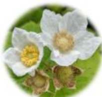
Thimbleberry Rubus parviflorus